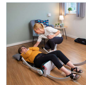
Step 2 – Assemble legs and backrest around the person