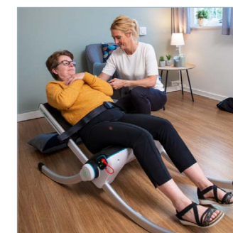
Step 3 – Secure the person and start the lift