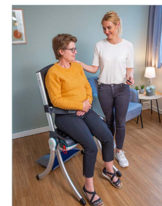
Step 4 – Person reaches near-standing position – transfer to chair